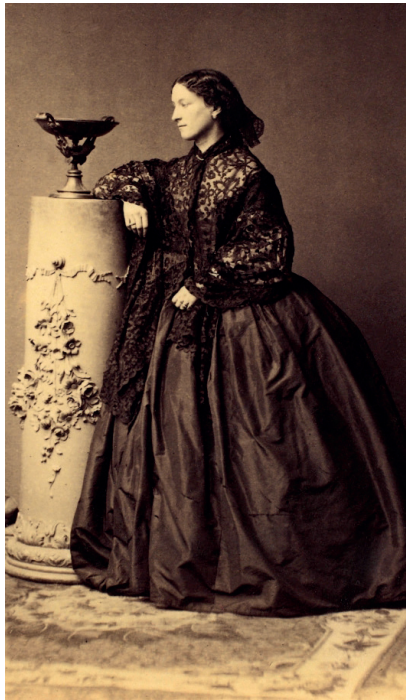
Jeanne Villepreux-Power, photographed in 1861 by André-Adolphe-Eugène Disdéri.

The aquaria were necessary for Villepreux-Power's studies of the paper nautilus, Argonauta argo . She needed a container that would let her watch young larval nautili grow into adults and see if they also developed their own shells. They did. She also found a small creature that looked