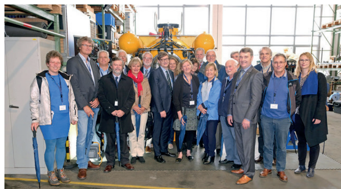
The team of evaluators with representatives of the Helmholtz Association in front of the submersible JAGO